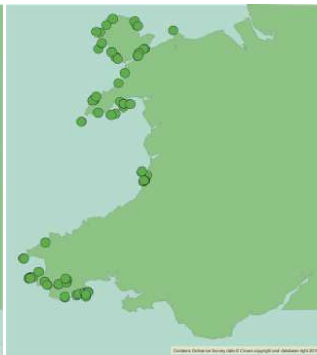
Observation Form records