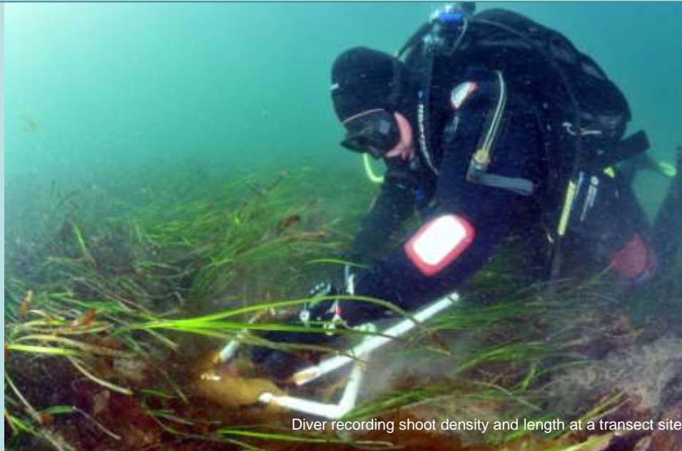
Diver recording shoot density and length at a transect site