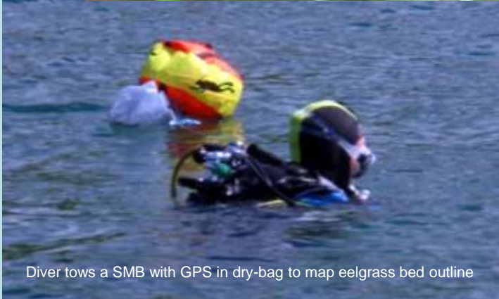
Diver tows a SMB with GPS in dry-bag to map eelgrass bed outline