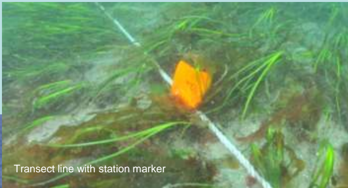
Transect line with station marker