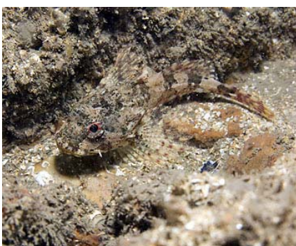
A long-spined sea scorpion

Rock outcrop surrounded by bedrock reef with gullies and short walls. Kelp and mixed seaweeds present in the shallows and mixed and dense faunal turf recorded down to 17m depth.