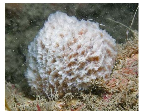
The nationally scarce sponge Tethyspira spinosa