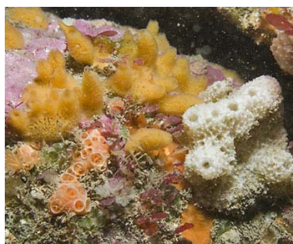
Different sponges at Pen-Las